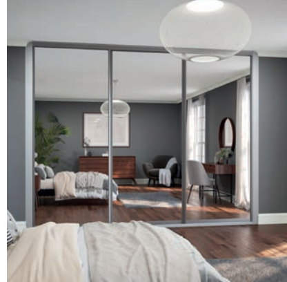
3 x mirror and Mist frame