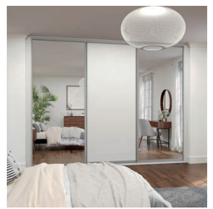
2 x mirror and 1 x Bianco frame