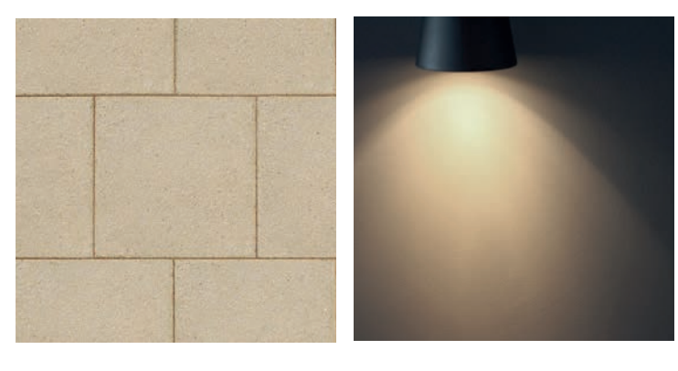
Additional paving slabs

Outside living space can be as important as your interior. With turf and an external tap both featuring as standard, why not treat yourself.