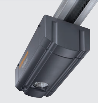
Remote electric garage door